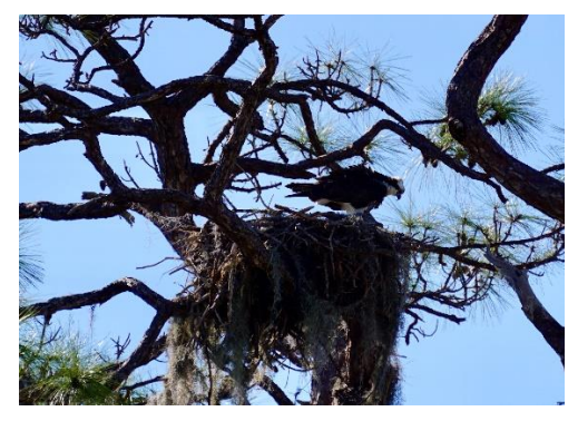
Hammocks Osprey Nesting, Feb 2021

Threats to osprey eggs and hatchlings are primarily opportunistic eagles. While socially interactive most of the time, during nesting season all bets are off. If you have witnessed sparring between an eagle and an osprey it is a midair show, that doesn't disappoint. So, the next time you stroll around Lemon Loop, take a minute or two to watch the activity in the nest. Perhaps if you are lucky you may catch a glimpse of a youngster or observe them during feeding time.