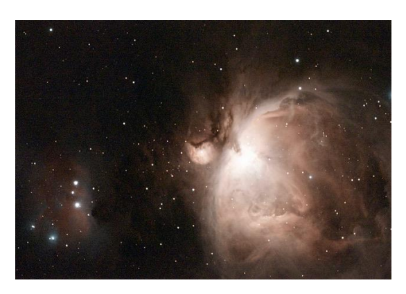
De Marian's Nebula - February 2021.