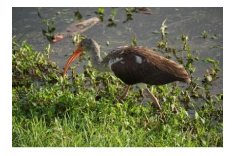
An Ibis searching for a snack – January 2021.